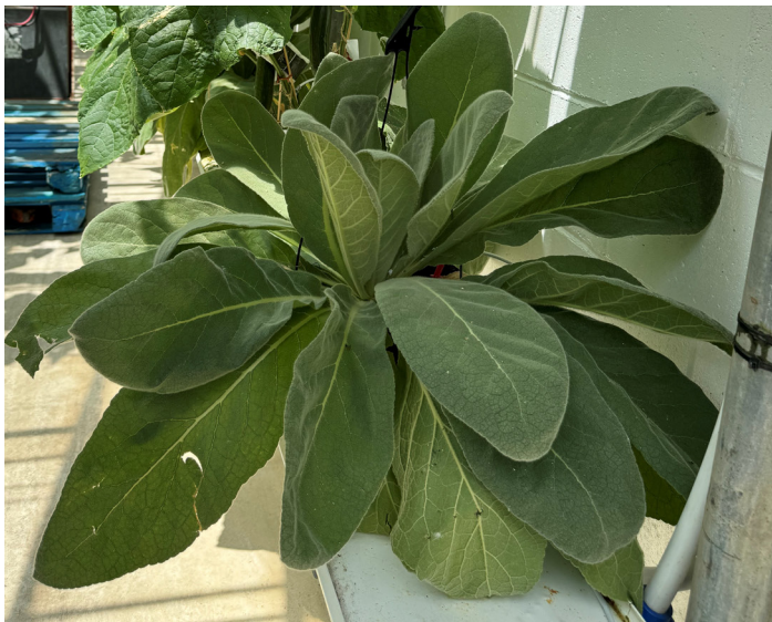
Mullein banker plant ( Verbascum thapsus )