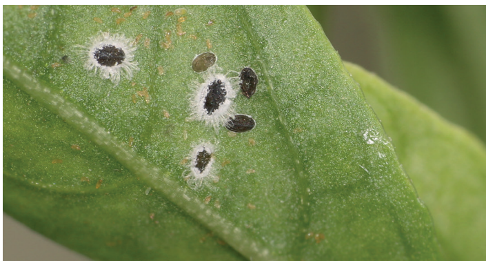
Parasitized greenhouse whitefly pupae on a leaf.

Do not expose the bottles or pods to direct sunlight